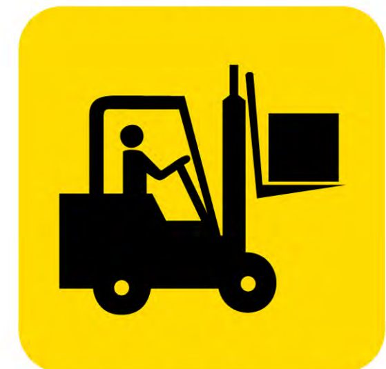
Forklifts / Machinery