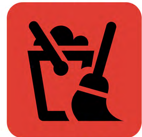
Housekeeping / Maintenance